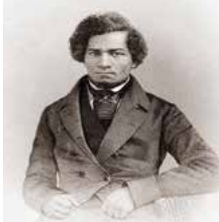
Frederick Douglass As Young Man