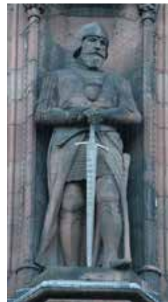
The Black Douglass

Douglass travelled to Scotland twice—first in 1845-47, then again in 1859. The first trip was part of a speaking tour that took him first to Ireland, then to the north of England, and finally on to Scotland, where he ended up spending most of his time while in Great Britain. Douglass quickly came to admire the Scots--because of their love of liberty and education, and because they treated him as an equal. He lived for a time in Edinburgh and travelled across Scotland, delivering more than 40 speeches against