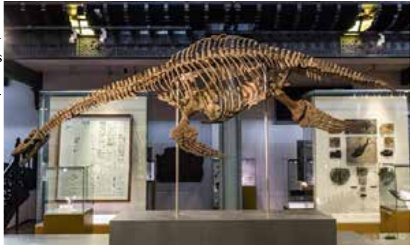
The skeleton of a plesiosaur on display at the Hunterian Museum at the University of Glasgow in Scotland.

But a discovery published in a paper last week by researchers in Britain and Morocco added weight to a hypothesis that some Loch Ness monster enthusiasts have long clung to: that plesiosaurs lived not just in seas, but in freshwater, too. That could mean, they reasoned excitedly, that Nessie, who is sometimes described as looking a lot like a plesiosaur, really could live in Loch Ness, a freshwater lake.