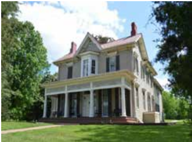
Frederick Douglass' home in 2021

Douglass's second trip to Scotland was prompted by a very different development: In the run-up to John Brown's raid on the federal arsenal in Harper's Ferry, VA (now WV) in 1859, Douglas had been in regular, though surreptitious, contact with several white abolitionists ("The Secret Six")—who planned and financed this armed raid, which had been designed to spark a slave rebellion in Virginia. Though he had advised the others against the plan, once it