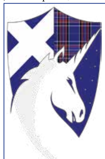
Logo of the Scottish Cultural Outreach Foundation